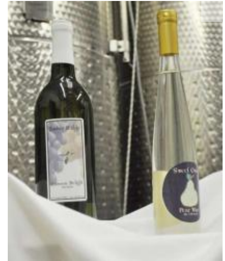
For the third year in a row, the Owen Valley Winery earned recognition at the annual Indy International Wine Competition, receiving silver medals for its Crimson Delight and Pear wines.

Through September, the winery will host bands for various events each and every Saturday. The winery has also been setup all season